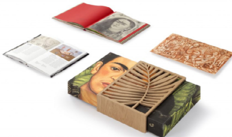
"The Dreams of Frida Kahlo" by ARTIKA publishing