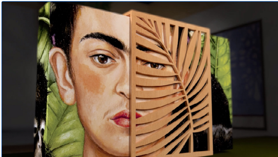
'The Dreams of Frida Kahlo' by ARTIKA publishing

Every single piece of "The Dreams of Frida Kahlo" has been exquisitely handcrafted by ARTIKA artisans in Barcelona, resulting in each copy being a true work of art itself.