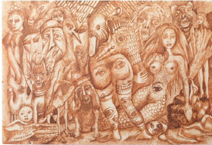
Frida Kahlo, The Liar (El Pájaro Nalgón) 1946.

A separated folder contains a large-scale original-sized reproduction of The Liar (El Pájaro Nalgón) 1946. This sepia drawing on paper is an enigmatic mosaic of figures.