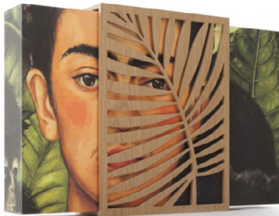
"The Dreams of Frida Kahlo" by ARTIKA publishing

"The Dreams of Frida Kahlo" outer case provides the first notion of the extreme artisanal vision which guided this project throughout. The striking case sculpture reproduces Kahlo's oil painting Self-portrait with Thorned Necklace and Hummingbird , 1940 (detail), which is revealed behind a veil of die-cut wooden leaves. Kahlo's intense gaze invites readers to delve into her most personal and unknown works discovering her most intimate thoughts.