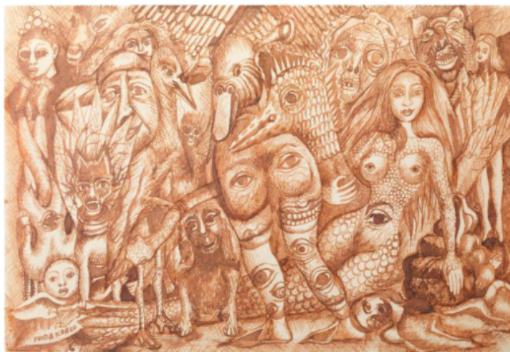
Reproduction of a large sepia print, 'El Pájaro Nalgón' ('The Liar') (1946)

Frida's Dreams is the culmination of four years of research, curation, and creation that celebrates petite Kahlo's gargantuan persona and prolific career.