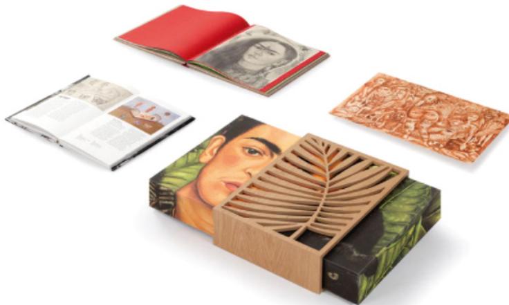
The Dreams of Frida Kahlo ARTIKA

All senses awaken, indulging in the scents of wood and lushly printed pages, the tactile array, the visual stimulation, and the revelations into the private life of the world's most famous woman artist. Frida's Dreams (Los Sueños de Frida) transcends luxury art books, featuring Frida Kahlo's drawings and paintings painstakingly crafted into a magnificent collection that unfolds like a gallery.