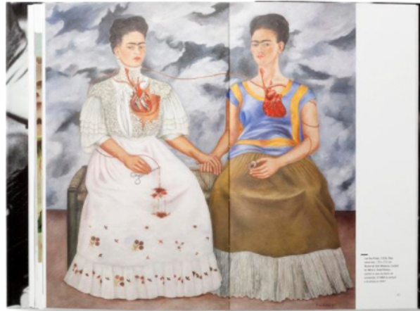
Pages 120|121 of the 'Study Book' featuring 'The Two Fridas' (1939) in the collection of Museo de... [+]