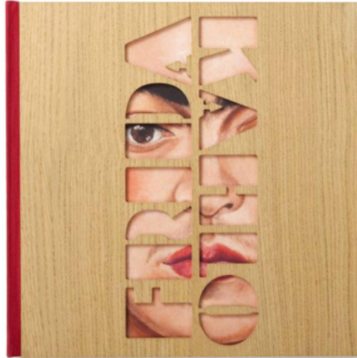
'Art Book' featuring a oak plywood cover carved into a cutout of Kahlo's name ARTIKA

Behold the resplendent 140-page Art Book , an elegant assembly of 34 drawings, reproduced in their original size and accompanied by quotes in Spanish in Kahlo's handwriting, culled from her diary. The back of each sheet, gently adhered to each page, is stamped with its number and provenance. Embark on an intimate journey into Kahlo's drawings that served as studies for oil paintings, self-portraits, and portraits of friends and lovers, fantasies and dreams, landscapes, and still-lives. It may take a few moments to open the Art Book , as your gaze will be fixed on the oak plywood cover carved into a cutout of Kahlo's name.