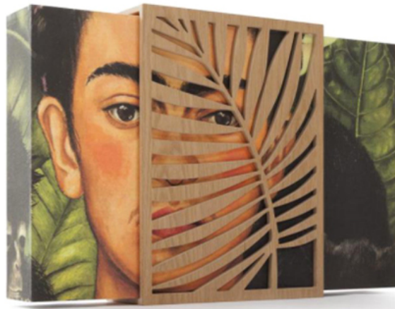
Outer shell features a detailed reproduction of Kahlo's 'Self-Portrait with Thorn Necklace and ... [+]